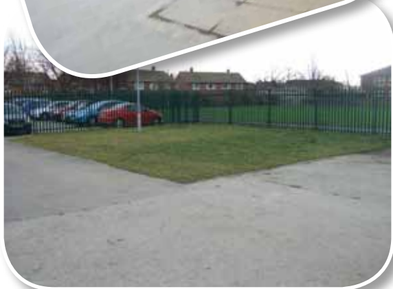
Site Before Development